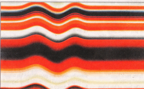
Polished: Exotic Particles is a thoughtful, experimental, probing show, full of quality.

ONWARD PRODUCTION in association with BLACK SWAN STATE THEATRE COMPANY present